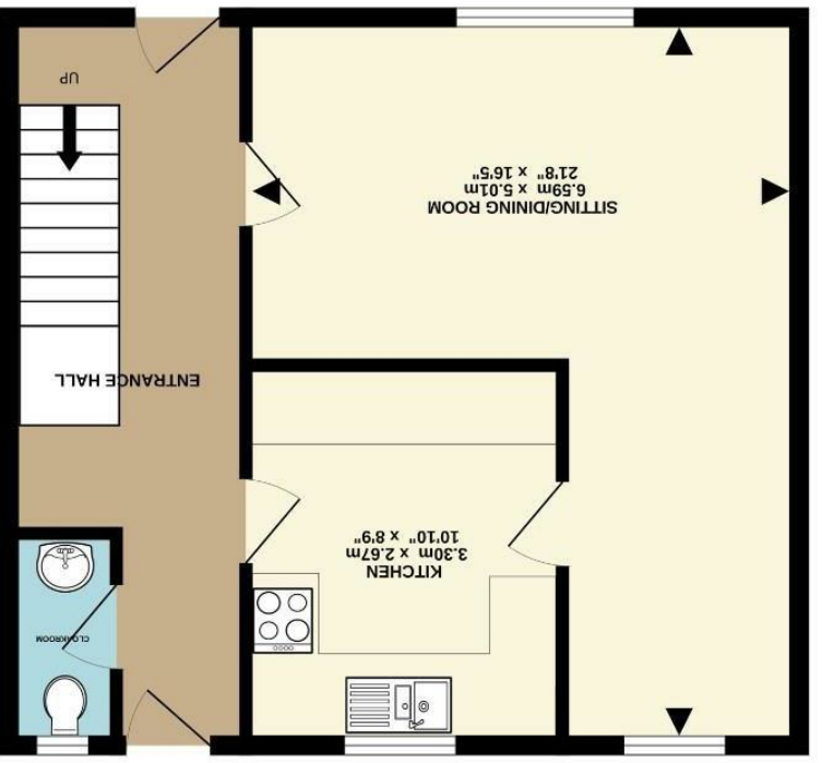
GROUND FLOOR 47.2 sq.m. (508 sq.ft.) approx.

TOTAL FLOOR AREA : 93.8 sq.m. (1010 sq.ft.) approx. Whilst every attempt has been made to ensure the accuracy of the floorplan contained here, measurements of doors, windows, rooms and other items are approximate and no responsibility is taken for any error, omission or mis-statement. This plan is for illustrative purposes only and should be used as such by any prospective purchaser. The services, systems and appliances shown have not been tested and no guarantee as to their operability or efficiency can be given. Made with Metropix ©2026